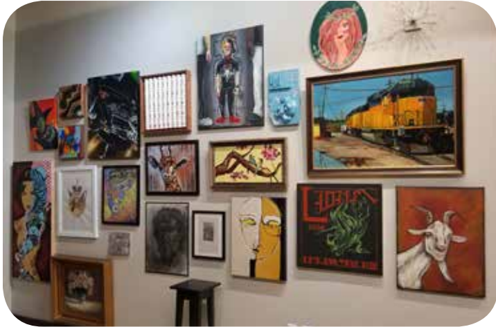
Assorted artwork from many of the featured artists.

On March 7th the NEA Artist Collective hosted its Spring Art Show at The Garage in downtown Jonesboro. Over 20 artists displayed their art for viewing and sale, including paintings, sculptures, photography, apparel, and more. Many attended the event and pieces were flying out the door to their new homes. You can follow NEA Artist Collective on Facebook and Instagram for updates on upcoming events and artist opportunities.